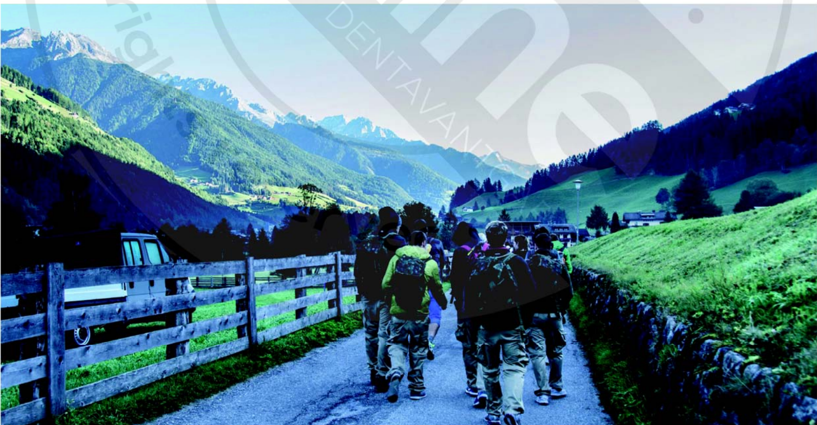
Cultural difference can build up barriers, but if common values are stronger than the ones specific to a culture, cultural difference is not important. During weekends, the participants dedicated their time to team building, taking part in events in the valley or organising trips.