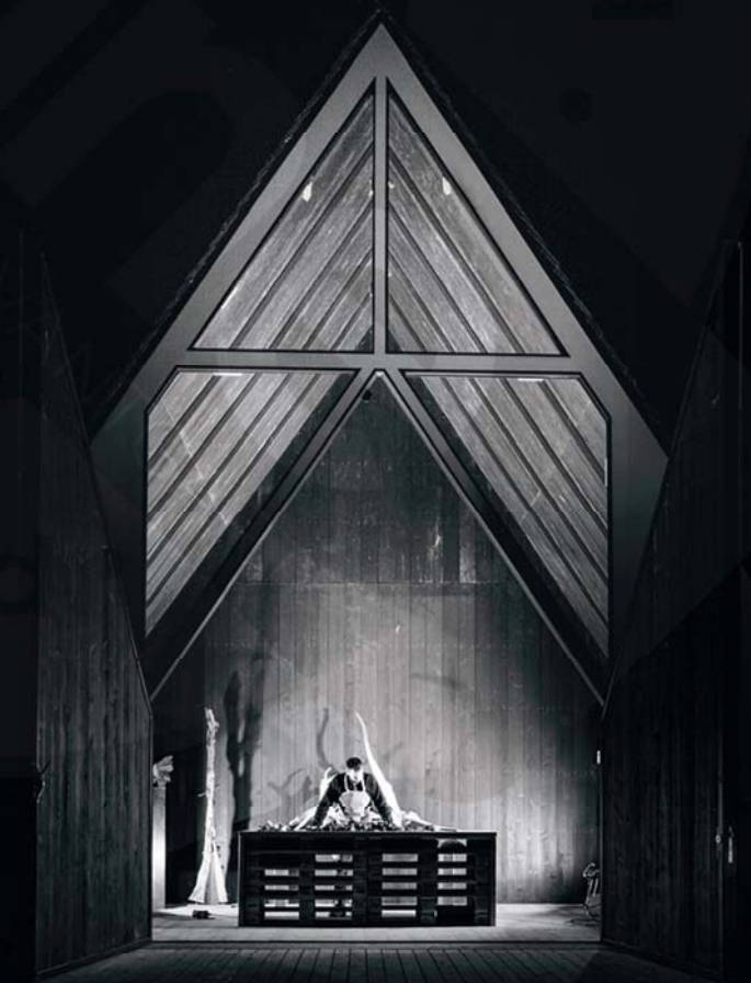
The Zirkonzahn School, an educational program for every target that combines dental technical teaching to school of life and culture.

Alongside the school trainings, the South Tyrolean firm offers a wide range of practical courses for every taste and level of expertise. Dental technicians interested in improving their skills in the use of the milling machines and the company’s software can subscribe to the CAD/CAM Milling courses, where they will also learn useful tips about workflow organisation and maintenance of the devices. For those who aim at improving their design skills in the software and learning more about material diversity and different digital approaches, CAD & Applications courses are instead the perfect solution. Dental technicians who are mostly interested in aesthetics and complementary techniques can finally find an answer to all their questions at the Applications courses. The courses are constantly updated and expanded according to the new innovations found by the research team of the Zirkonzahn’s dental laboratory. Every new solution is implemented into the training programs through intensive sessions, in which experts and participant can exchange ideas and learn together in a collegiate atmosphere.